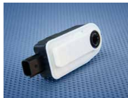
Smart LIN PWM motor