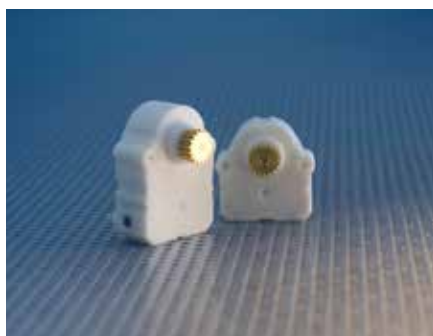
Rotary stepper motor